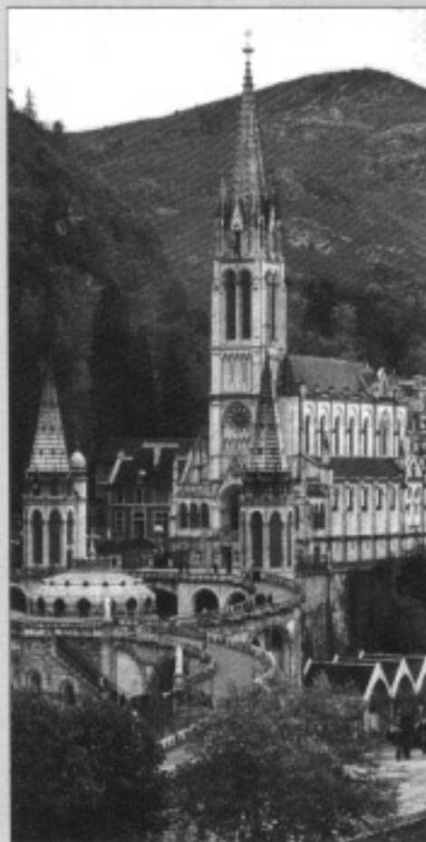
The shrine of Lourdes. Our Lady's last appearance to St. Bernadette, occurred on the feast of Our Lady of Mount Carmel.

In assuming the title of Our Lady of Mount Carmel at Garabandal, and by holding out the scapular to us, as it were, by carrying it frequently at her wrist, the Blessed Virgin was telling us that it still pleases her that we wear her mantle and that she will continue to bless and protect in a special way those who do this with faith and confidence. Our Lady even seemed to be telling us something by the very size of the scapular she carried. It was unusually large, similar in size to the maniple that the priest formerly wore at Mass over his left arm. It was as though the Blessed Virgin wanted to be sure that we would not fail to notice the scapular, as though she was trying to impress us in this concrete way with the importance she attaches to it. □