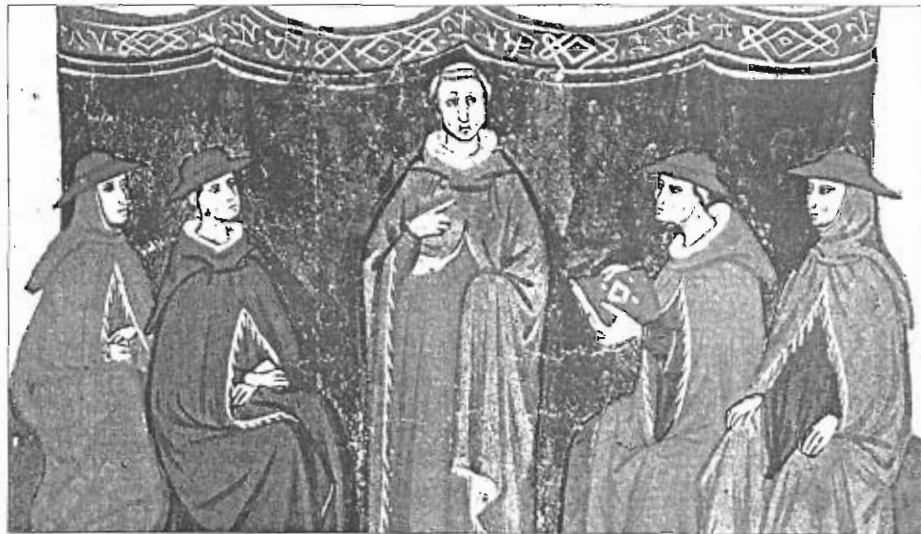
Pope John XXII, one of the Avignon popes, is believed to have issued the bull in 1322 known as the "Sabbatine Privilege."

A short time after the scapular apparition, Simon sent two of his Carmelite brothers to the Pope, who eventually took the Order under the protection of the Holy See. Simon also wrote a detailed account of Our Lady's visit and promise and sent it to all the Carmelite monasteries. Devotion to the scapular began to spread, miracles to take place. Popes and bishops, kings and queens, nobles and peasants, all wanted to be invested in the brown scapular to obtain what Our Lady had promised. A confraternity was formed to foster devotion to