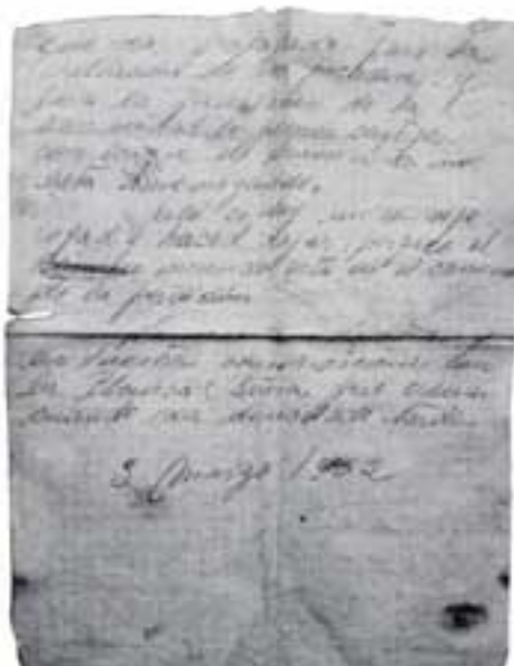
The original Spanish translation (dated March 1962) of the letter in Italian that came from Padre Pio.