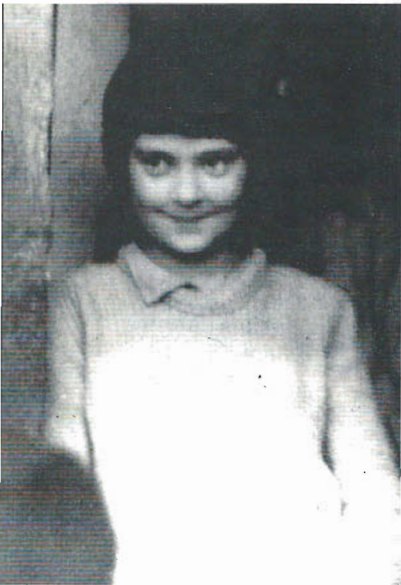
Jacinta in 1961. The young daughter of poor parents in a remote mountain village would in later life ask herself, "Why me?"

but said that all would come into the Catholic Church. The way she said it was all humanity would be within one Church, the Catholic Church . She also said it was very important to pray for this intention.